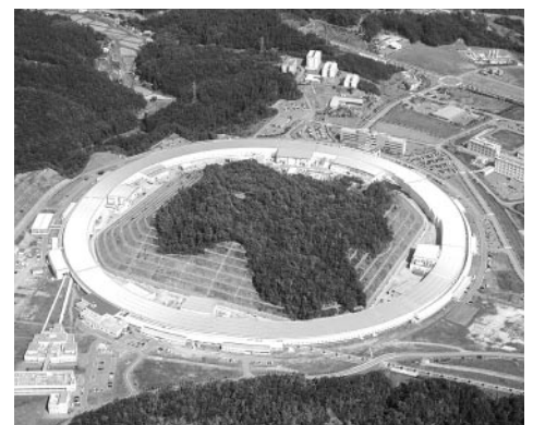
Presented by: Japan Synchrotron Radiation Research Institute

First, with regard to the XAFS (X-ray Absorption Fine Structure) system which is widely used by industry, we will establish a beamline purely for this application. Also, since many companies at this time are conducting research on an independent basis, there is a lot of similar research going on without collaboration, leading to inefficiencies. So in order to facilitate more efficient use of the beamlines, basic research to develop solu-